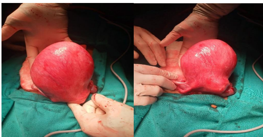
Fig. 2. The uterus is observed during the transoperative period with the presence of a large tumor on the posterior face.